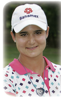
Lorena Ochoa #1 on Money List

With the US-based health jewelry sales in the past ten years reaching over $50 million, the results were surprising: newcomer Shuzi performed best, better than supposed market leader Q-Ray. After following each product's instructions on proper usage, we got tested by a certified professional on the BioMeridian machine – first without any health jewelry to get a baseline, and subsequently with each piece. The results were clear – only Q-Link and Shuzi reduced stress in my body. Because the Shuzi bracelet passed the BioMeridian assessment with flying colors and we really hadn't heard much about it, we thought it wise to delve a little deeper and find out more about our undisputed champion.