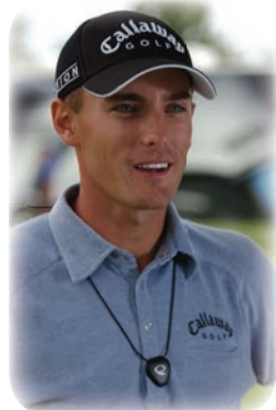
Charles Howell III 2007 Nissan Open Winner

In the health and sports jewelry market, you will find an assortment of labels like SRT3, ionization, magnetics, titanium and vibrational technology, just to name a few, but what does all this mean? Is there science behind any of it? Why do the pros wear them? Does it really help their games? And, most importantly, will it help ours?